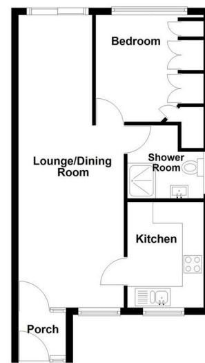
Total area: approx. 45.6 sq. metres (490.6 sq. feet) 35 Elm Lodge, Hopton Road, Cam, Dursley, GL11 5PL